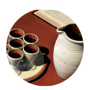
FULL COMMUNION PARTNERS